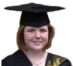
On her Graduation as a BSc in Ocean Sciences

Insufficient interest has been shown to make a trip to Europe in 2008 viable. Other options are now being considered. Please see Roger Saltrick if you are interested in visiting Strasbourg or Nantes but time is running short for a trip in 2008 unless we try to arrange a much bigger contingent to visit the 2008 Festival of Fishkeeping.