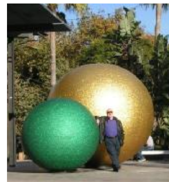
You should see the tree!